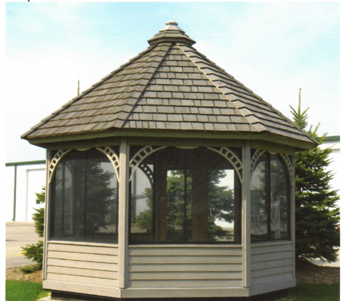
14' single tier with arch brackets

Garden Getaway Gazebos, Inc. 1234 West Scott Street Fond du Lac, WI 54937 866-923-9070