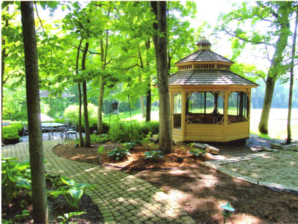
Two tier 14' three season gazebo with standard brackets

7 deck sections 83" corner to center with 6' ends. Tongue and groove 2x6 Douglas fir flooring. No surface fasteners. Floor sections are numbered and predrilled for dowels. Four coats of Sherwin Williams waterborne varnish are applied to the floor. Interior walls and ceiling have two coats of Sherwin Williams Woodscapes exterior finish SW3513 Spice Chest. Deck sections are fastened to a .24 qca pressure treated wood foundation wall set on a 3/4" stone footing. Foundation is perimeter vented and rodent proofed. Foundation is backfilled with 3/4" stone. Wall sections have 1/2"x5 1/2" clear, vertical grain beveled cedar siding. Include tempered glass aluminum extrusion slider windows with full screens. Solid cedar double entrance doors with Schlage leverlock entrance hardware. Prewired for ceiling fan (owner supplied and installed), 32" LED TV with DVD player and 37" blue tooth sound bar, 4 duplex outlets, 2 switches, all accessible for future changes or additions. Roof sections with 1x12, 1x10, 1x8 knotty western red cedar, 2x4 s4s knotty western red cedar rafters, 18" tapersawn vertical grain #1 western red cedar shakes applied 8" exposure.