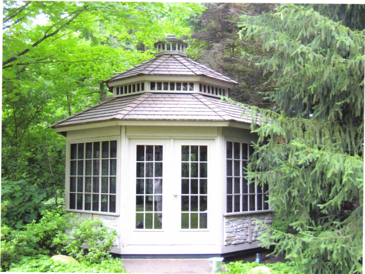
Two tier 16' three season gazebo

8 deck sections 94 1/4" corner to center with 6' ends. Tongue and groove 2x6 Douglas fir flooring. No surface fasteners. Floor sections are numbered and predrilled for dowels. Four coats of Sherwin Williams waterborne varnish are applied to the floor. Interior walls and ceiling have two coats of Sherwin Williams Woodscapes exterior finish, SW3513 Spice Chest. Deck sections are fastened to a .24 qca pressure treated wood foundation wall set on a 3/4" stone footing. Foundation is perimeter vented and rodent proofed. Foundation is backfilled with 3/4" stone. Wall sections have 1/2"x5 1/2" clear, vertical grain beveled cedar siding. Include tempered glass aluminum extrusion slider windows with full screens. Solid cedar double entrance doors with Schlage leverlock entrance hardware. Prewired for ceiling fan (owner supplied and installed), 32" LED TV with DVD player and 37" blue tooth sound bar, 4 duplex outlets, 2 switches, all accessible for future changes or additions. Roof sections with 1x12, 1x10, 1x8 knotty western red cedar, 2x4 s4s knotty western red cedar rafters, 18" tapersawn vertical grain #1 western red cedar shakes applied 8" exposure.