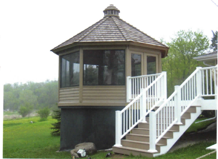
16' single tier-elevated standard foundation

Garden Getaway Gazebos, Inc. 1234 West Scott Street Fond du Lac, WI 54937 866-923-9070