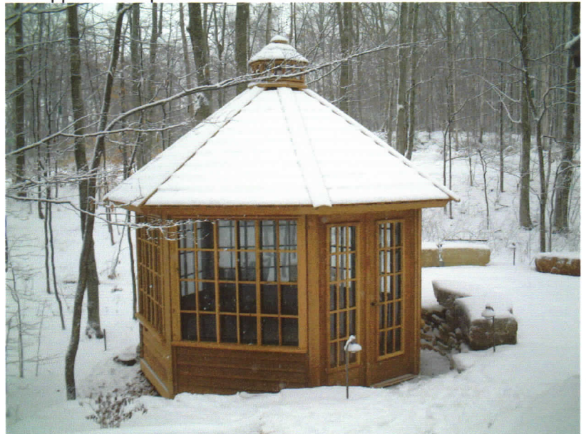
12' single tier with French grills

Garden Getaway Gazebos, Inc. 1234 West Scott Street Fond du Lac, WI 54937 866-923-9070