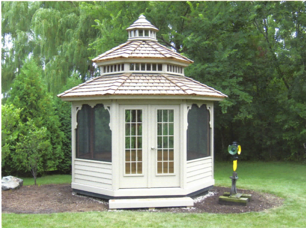
Two tier 12' three season gazebo with Victorian brackets-door grills

7 deck sections 83" corner to center with 6' ends. Tongue and groove 2x6 Douglas fir flooring. No surface fasteners. Floor sections are numbered and predrilled for dowels. Four coats of Sherwin Williams waterborne varnish are applied to the floor. Interior walls and ceiling have two coats of Sherwin Williams Woodscapes SW3513 Spice Chest. Deck sections are fastened to a .24 qca pressure treated wood foundation wall set on a 3/4" stone footing. Foundation is perimeter vented and rodent proofed. Foundation is backfilled with 3/4" stone. Wall sections have 1/2"x5 1/2" clear, vertical grain beveled cedar siding. Includes tempered glass aluminum extrusion slider windows with full screens. Solid cedar double entrance doors with Schlage leverlock entrance hardware. Prewired for ceiling fan (owner supplied and installed), 32" LED TV with DVD player and 37" blue tooth sound bar, 4 duplex outlets, 2 switches, all accessible for future changes or additions. Roof sections with 1x12, 1x10, 1x8 knotty western red cedar, 2x4 s4s knotty western red cedar rafters, 18" tapersawn vertical grain #1 western red cedar shakes applied 8" exposure